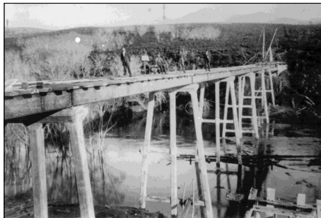
Pukehoua Bridge during construction.

At the next hearing on 25 April, it was argued by Raglan that the bridge was unnecessary as