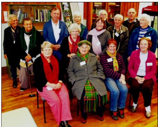
The volunteers at the training day