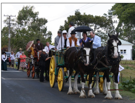
The Pirongia Clydesdales always add authenticity to historic events.

wedding dresses from the 1940s. Although initially planned only for the weekend, the display generated sufficient interest to remain open throughout the following week.