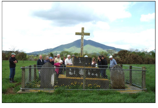
At the Te Kopua Wesleyan Mission Site