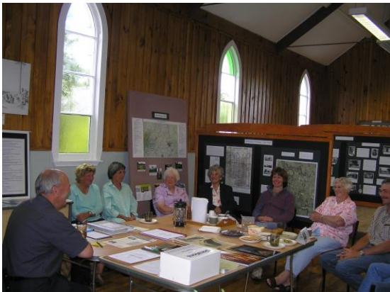
Planning for the combined visit to the Auckland War Memorial Museum

In the last Newsletter, members were advised that the Historic Visitor Centre had become an institutional member of the Auckland Museum Institute and a visit by our members was proposed to enable us to find out about the War Memorial Museum's services and resources which may be used in the development of our own archives and displays.